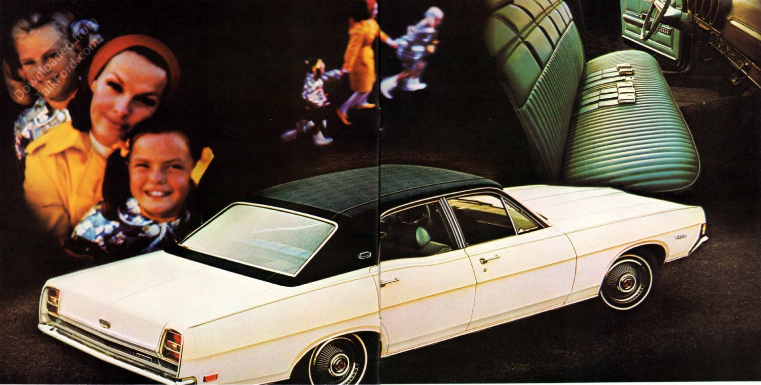
Ford Torino 4-Door Sedan—quick size, loaded with luxury, at a modest price

1969 Ford Torino. New performance car? Or new luxury car? Yes.