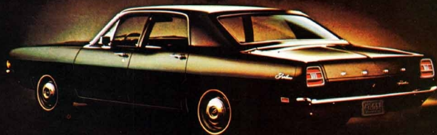
Fairlane 4-Door Sedan, roomy better idea for the value-conscious