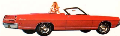
Sun-loving, fun-loving Fairlane 500 Convertible

It's a sedan, with all the advantages you get in a sedan, but its styling is definitely for the young-at-heart. Fashion-right bright accents highlight the exterior. You can get the optional deluxe wheel covers like those on the sedan above, or styled steel wheels like those on the convertible at left, depending on your taste. And inside, strictly first cabin. New instrument cluster with brushed aluminum dials, very attractive teak-toned