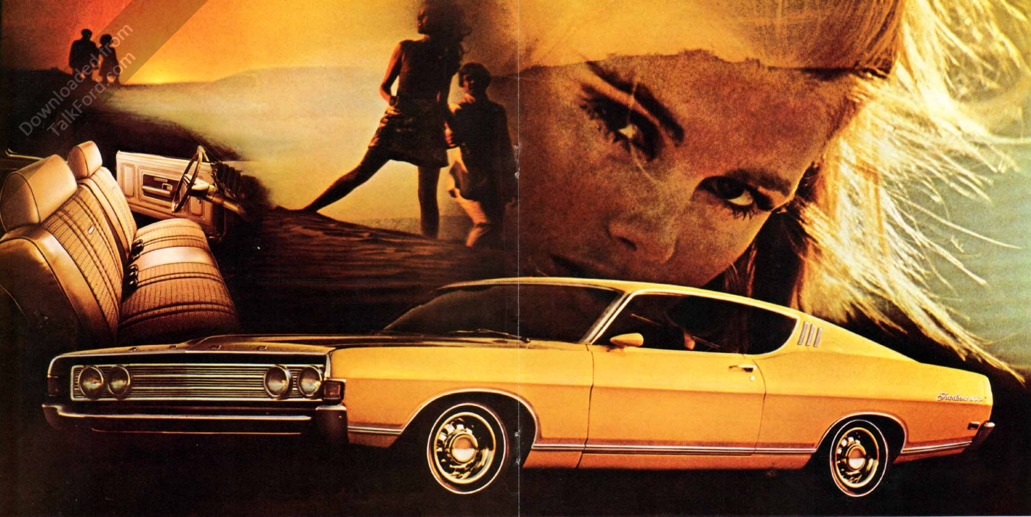
Fairlane 500 SportsRoof—striking looks, agile go, delightful comfort

Fairlane 500. More power. New style. Eager to go.