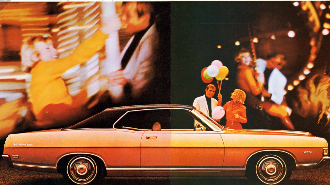
Fairlane 500 2-Door Hardtop with optional vinyl roof cover and deluxe wheel covers

Fairlane 500—the way to get to where you're going in pleasing style, luxurious comfort and at a surprisingly modest price.