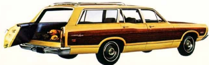
Ford Torino Squire, with Better Idea convenient two-way Magic Doorgate

1969 Ford Torino. New performance car? Or new luxury car? Yes.